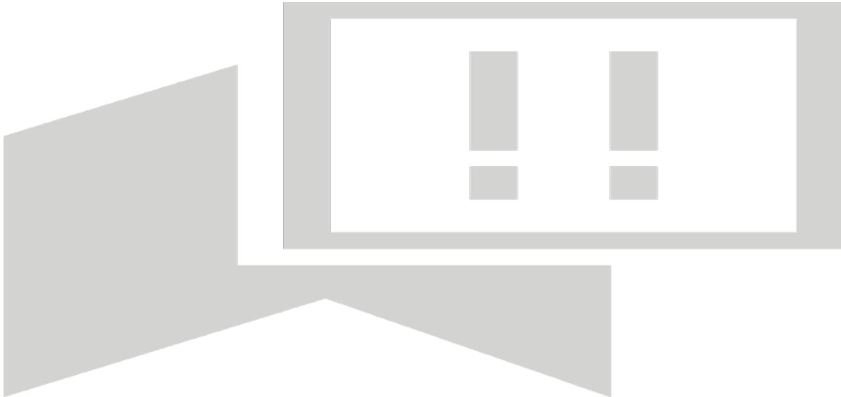
Figure 2.1: An overview of the civic registration and vital statistics interface